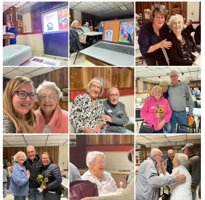
Nonagenarians and friends at our October meeting.

Watch our Facebook page for postings for another oral history program called Nonagenarians 2.0 and reach out to us with someone 90+ you think might like to be interviewed for the next round of preserving our stories about Riverside!