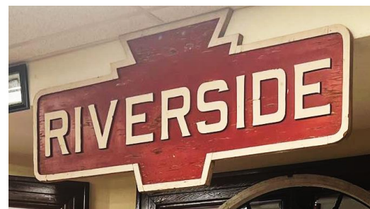
Original Riverside station sign which was once on the exterior of our building now lives inside!

What would social media look like in early Riverside? Wonder no more! Taken from Riverside newspapers: