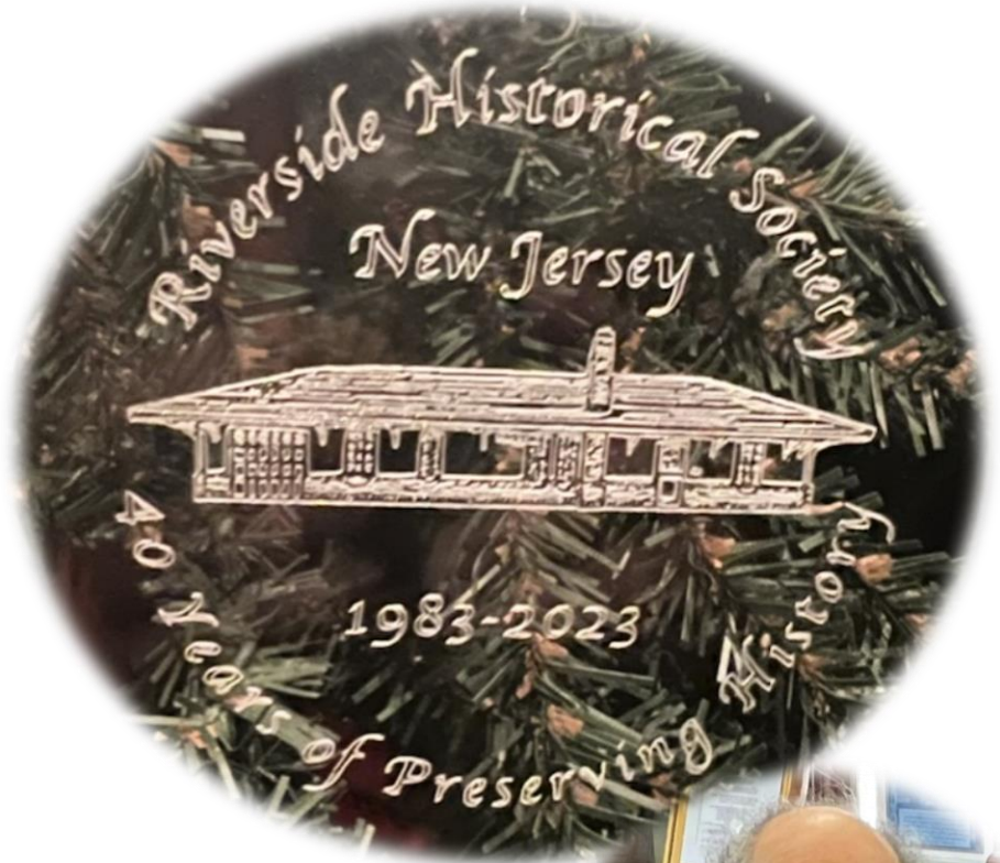
Top: One of the two 2023 holiday ornaments celebrated our 40 th year as an organization.

While we have a lot to be proud of, we look forward to all the milestones still ahead of us. We hope you'll join us in our mission to educate and preserve for the next generations of residents and visitors! Stop by, bring a friend, or make some new ones at one of our open days or meetings soon!