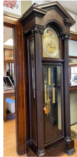
The grandfather clock from Zurbrugg Memorial Hospital!

We celebrated 40 years of sharing, archiving, and preserving the history of Riverside in 2023. We thought we'd share some of the notable gifts we've received throughout our time established: