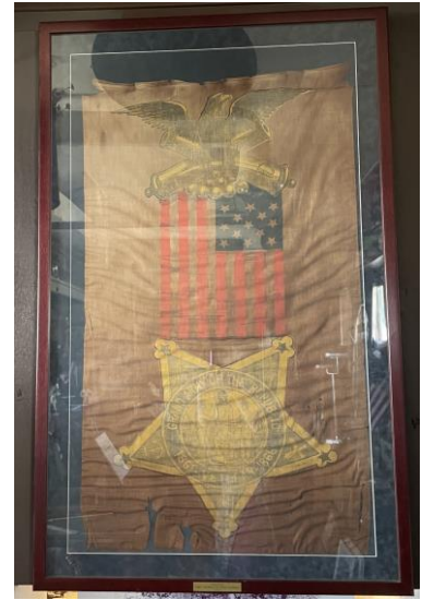
Grand Army of the Republic flag which is of the Civil War era!